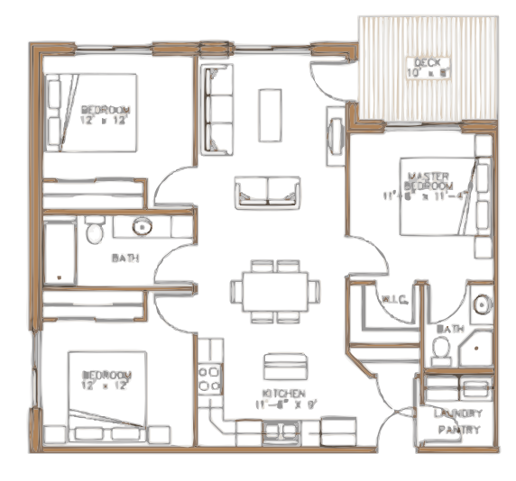
Three Bedroom 1,082 sq.ft.